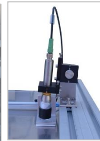
Laser marker for cutting position