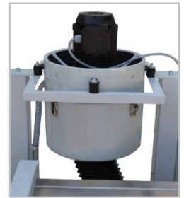
Exhaust air filter