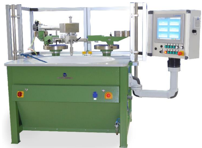
RAL 6011 resedagreen